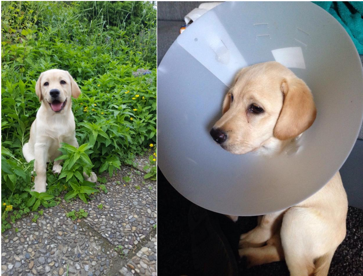
Juno (before and after)

*Facebook Group: "Is Bravecto Safe" Website: www.isbravectosafe.com